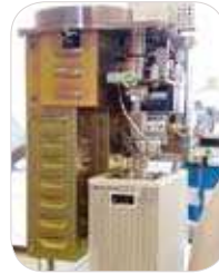
Pyrolysis of the organic coating

Pyrolysis of the organic coating coupled with Gas Chromatography and Mass Spectrometry (GC-MS) allows determination of the main Volatile Organic Compounds (VOCs) generated during welding, resulting in qualitative and semi-quantitative results.