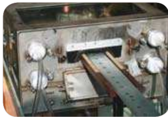
Sampling welding fumes during spot welding

A laboratory welding test using the OCAS Toxibox - a self-engineered piece of equipment - to efficiently sample dust and gas for further quantitative analysis.