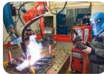
Sampling at the workplace for further analysis

Workplace analysis is recommended to complete the risk assessment. Thanks to the pyrolysis and Toxibox results, this workplace analysis can be carried out in reduced time for an affordable price.